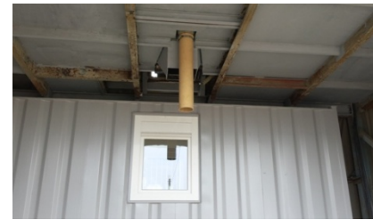
After Close Up