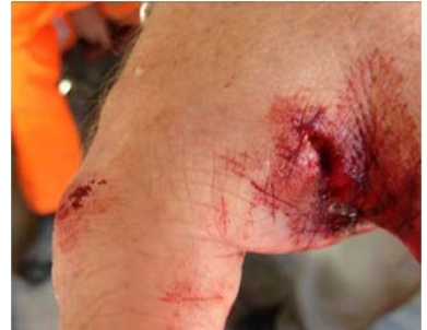
Employee badly cuts hand after tripping and falling

When reviewing these accidents, in which colleagues have suffered considerable pain and discomfort, it is apparent that nearly half have involved wounds to hands / fingers . Injuries have included amputation of part of a little finger and several examples of broken fingers / thumbs and cuts requiring stitches.