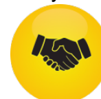
Respect the Law & Other Drivers