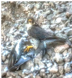
Table For One

Melvyn from our Wenvoe Quarry took this fantastic shot of a Peregrine Falcon tucking into its lunch of pigeon the other day.