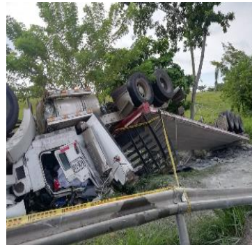
Final position of truck