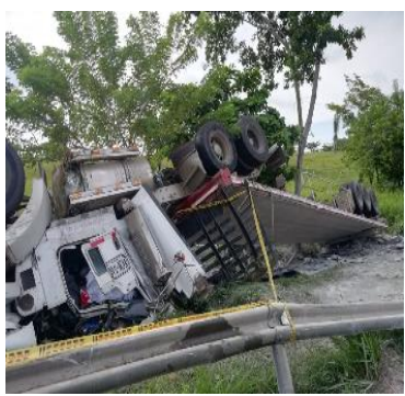
Final position of truck