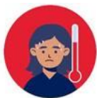
Identify and Inform

We urge all employees to continue to be vigilant as the risk has not been removed despite lockdown measures easing. Remember to follow the four behaviours at all times and appreciate your personal responsibility to prevent the spread of the virus: