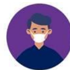
Protect Yourself & Others