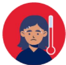
Identify symptoms and inform