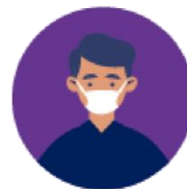
Protect yourself and others