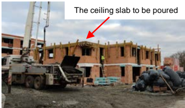
The ceiling slab to be poured

On the morning of 30/11/2020 (7:30 AM) a pump truck operator arrived on site. He was given instructions to park the pump truck. He was also told which ceiling was going to be poured. In order to get to the work place, he had to use a ladder to get to the 1st floor. The area he entered did not have proper lighting. He didn't notice an unsecured opening in the floor while he was walking and he fell to the ground.