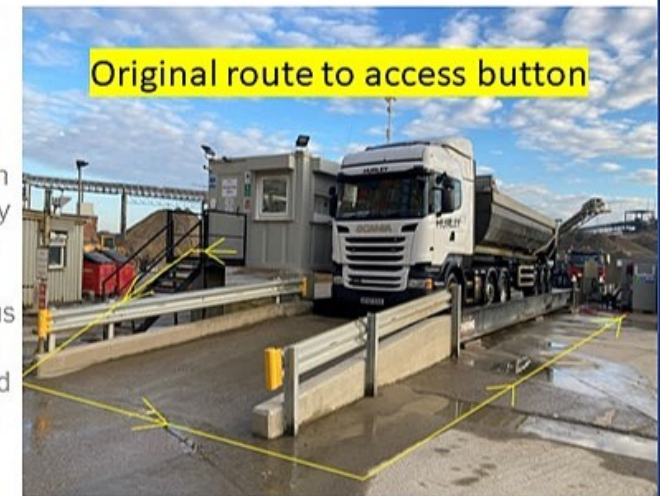
Original route to access button