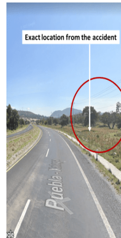
View of the Driver before the incident