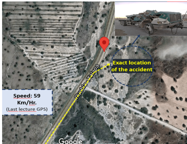
Route of the truck

A contractor was driving on a highway at 59 km/h with 16 tons of bagged cement when he fell asleep and lost control of his truck on a curve in the road, causing it to overturn onto its right side.