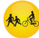
Other Road Users