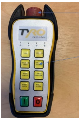
Remote Stop/Isolation button.