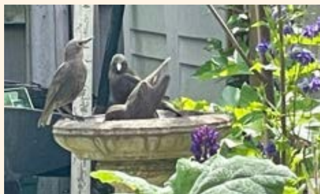
Young Starlings bathing

OK, so it's started raining as I write this. However, we had a prolonged dry spell, and may get more, when wildlife can struggle to find water. An easy action you can take to help wildlife is to provide water. You can get bird baths, but anything that holds water and wildlife can access is OK. I have a large flowerpot saucer placed on the ground. I've put a two pence piece in the water because it's supposed to stop algae growing.