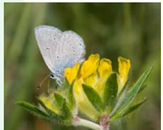
Photo: Small Blue on Kidney Vetch © Keith Warmington, Butterfly Conservation Warwickshire

After quarrying has been completed, an area of Kensworth has been left to naturally colonise as chalk grassland. There is now lots of Kidney Ketch and we were pleased to find the first Small Blues recorded there. We believe they've moved from the nature reserve. A female was watched egg-laying in the flower heads of Kidney Vetch so we're delighted to see a colony being established.