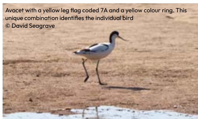
Avocet with a yellow leg flag coded 7A and a yellow colour ring. This unique combination identifies the individual bird

Bird ringing – fitting a small metal ring to the leg of a bird started back in the early 20th century and helped unlock the mysteries of bird migration. It is still used today along with colour ringing, fitting combinations of colour rings to a bird's leg that show when and where it was ringed. The metal rings used have a unique code, but it needs another ringer to catch the bird to read it. The advantage of colour ringing is that birdwatchers and photographers can record the combinations so providing more records.