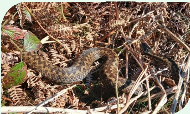
Photo: Female Adder showing how well camouflaged it is against dead Bracken

When not out visiting sites, I've been helping support the planning team with work on planning applications for new quarry areas and developing management advice for non-operational areas.