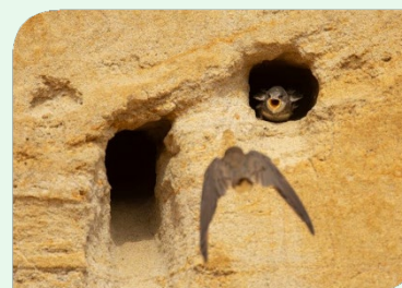
Sand Martin nest

The easiest way to mitigate against negative impacts to breeding birds is to time operations to occur outside the bird breeding season. Examples of operations that can affect breeding birds are hedge cutting, tree works, ground clearance and roof work on buildings. Again, please seek advice if you any concerns.