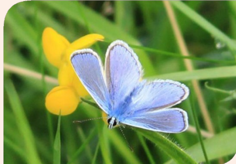
Male Common Blue butterfly

It is #NationalMeadowsDay on Saturday 4 July so a perfect time to find a meadow and enjoy its wildlife.